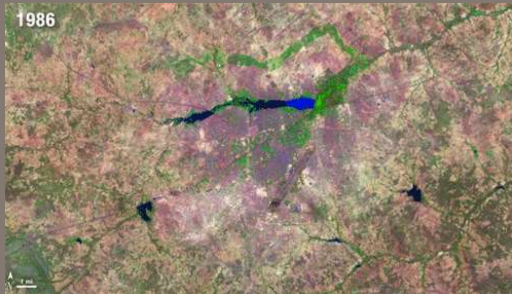
Ouagadougou, Burkina Faso - 1986 and 2006